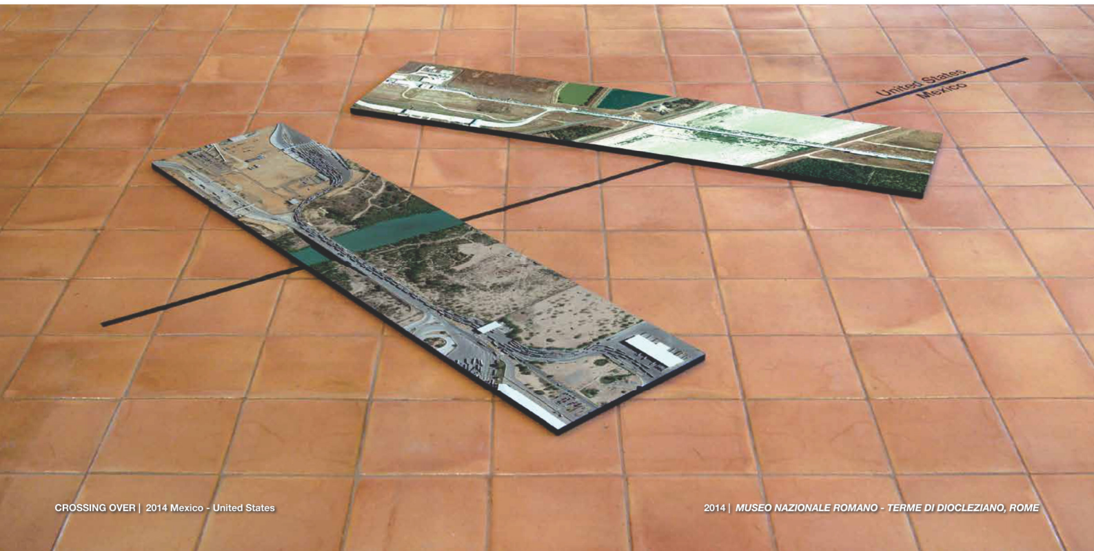
CROSSING OVER | 2014 Mexico - United States