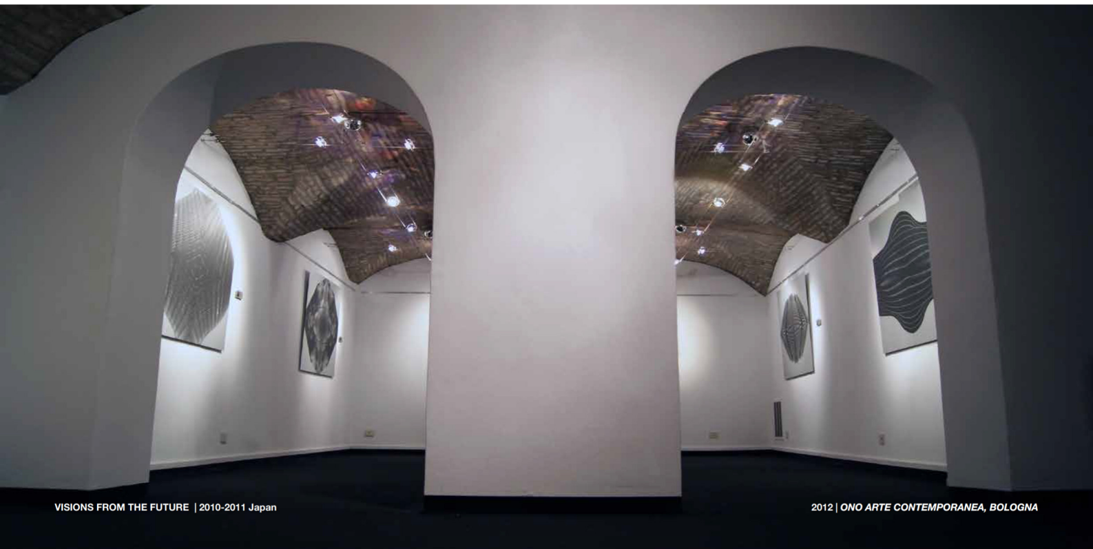
VISIONS FROM THE FUTURE | 2010-2011 Japan