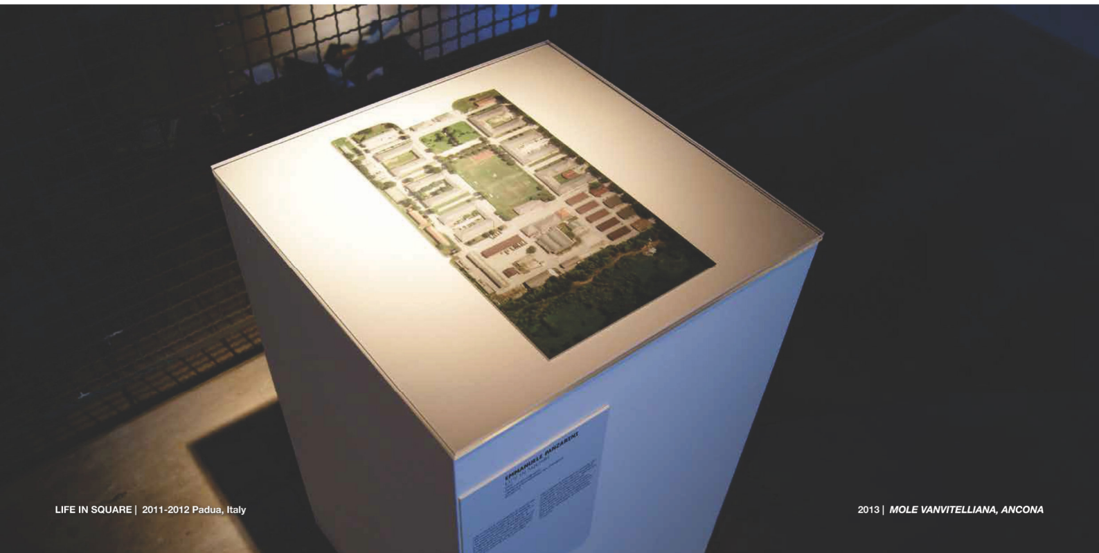
LIFE IN SQUARE | 2011-2012 Padua, Italy