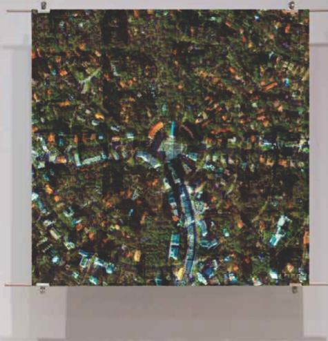
2013 | EX UPIM - PALAZZO conTEMPORANEO, UDINE