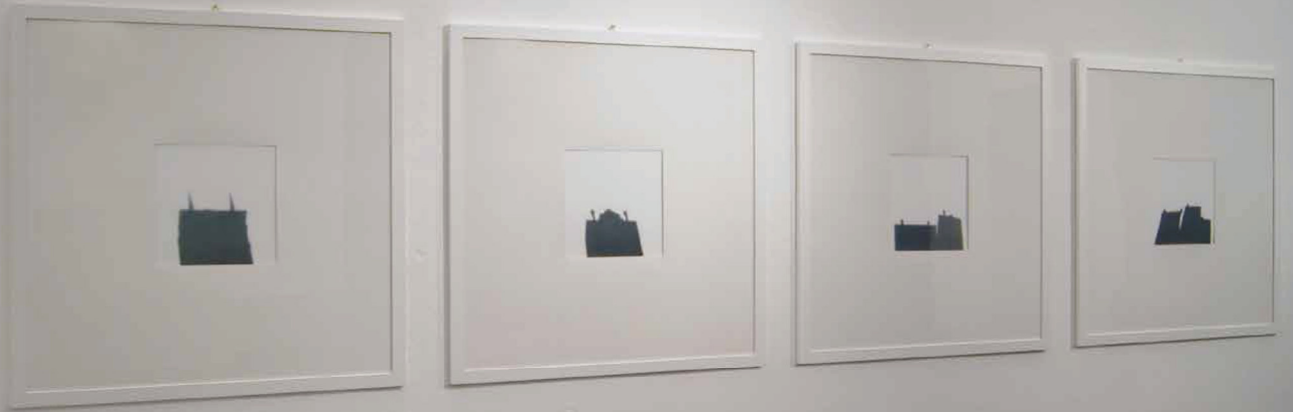
SHADOWS OF THE SOUL | 2012 Venice, Italy