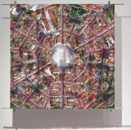
URBAN GEOMETRIES | 2013 Udine, Italy