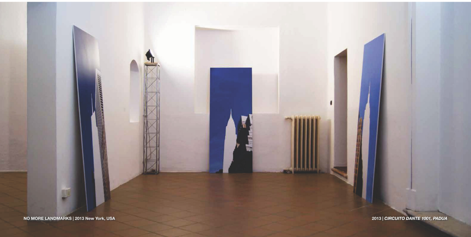
NO MORE LANDMARKS | 2013 New York, USA