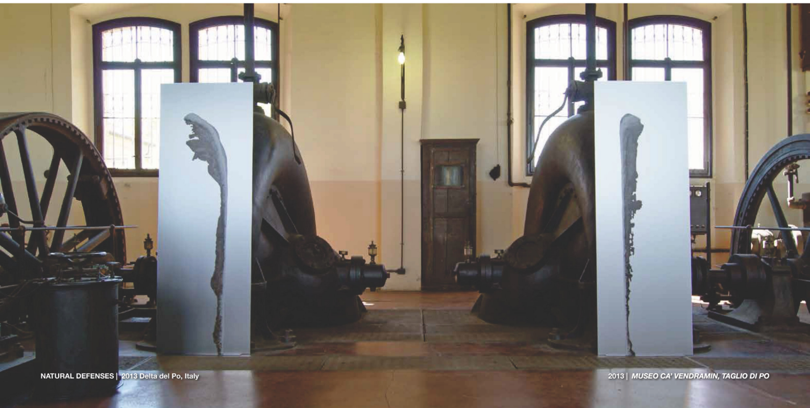
NATURAL DEFENSES | 2013 Delta del Po, Italy