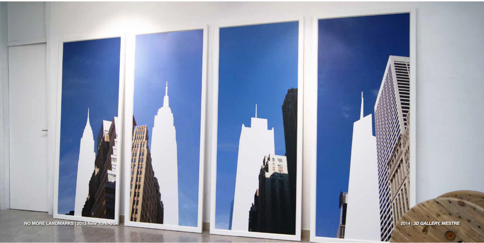
NO MORE LANDMARKS | 2013 New York, USA